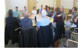
April 1, 2015 Public Meeting Series