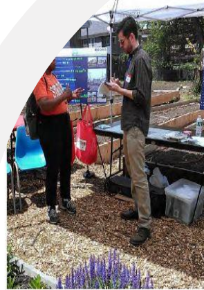
Farmland Public Outreach Event