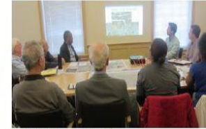
April 1, 2015 Public Meeting Series