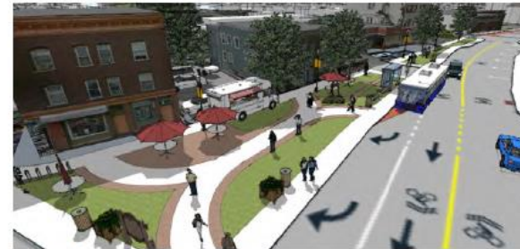
Conceptual Rendering, Boxer Square Public Plaza