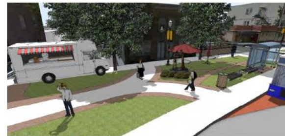
Conceptual Rendering, Boxer Square Public Plaza