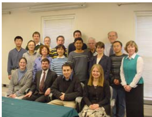
CTI Staff with Transportation Graduate Students and Faculty